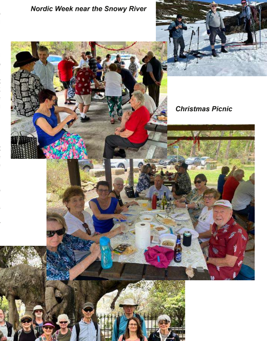
City Ramble - in Centennial Park

We look forward to seeing you on a walk.