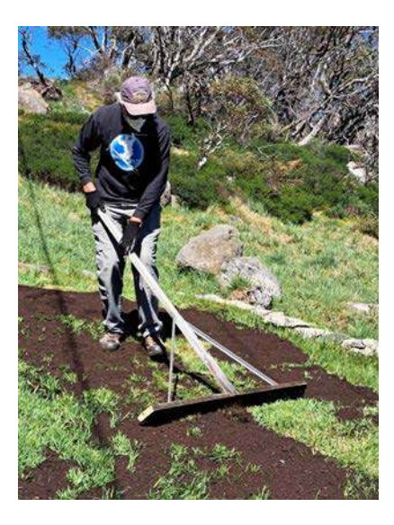
Kahane site revegetation