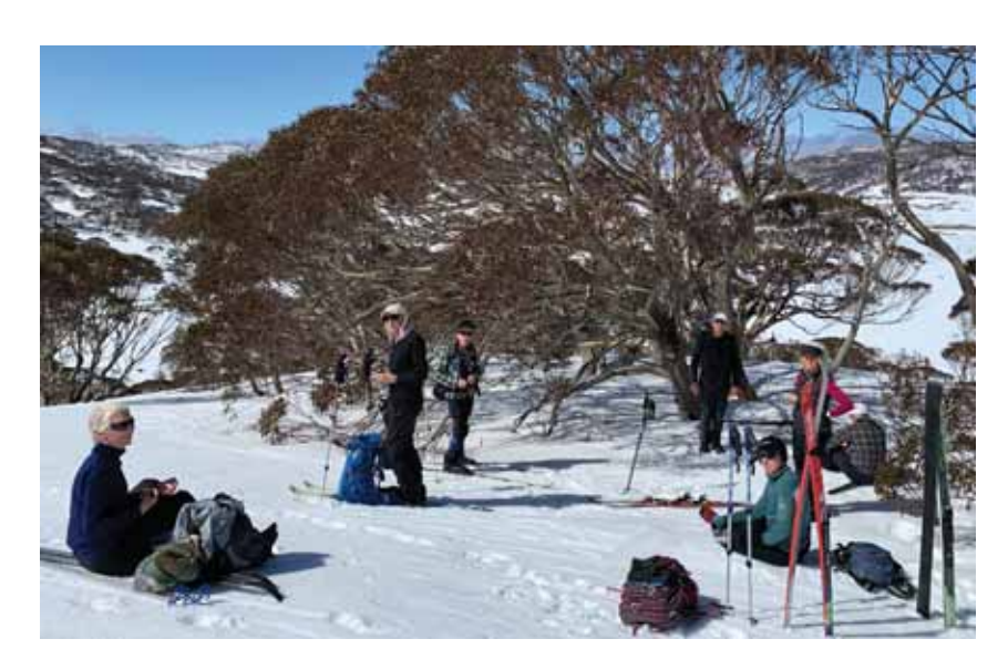
Nordic Week - Coffee above Spencers Creek