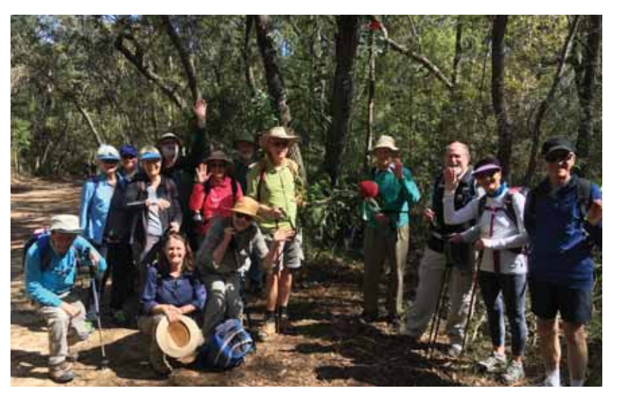
Duffy's Forest Waratahs