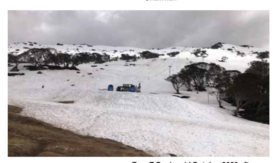
Eyre T-Bar in mid October 2022 after a ski down from the top