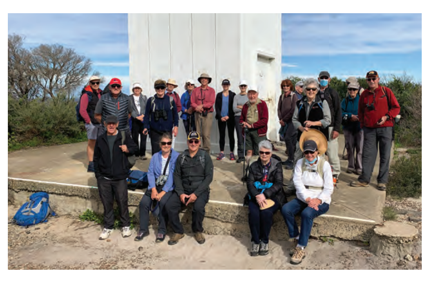
Cape Bailey Lighthouse

On Friday a group of 12 skied from Dead Horse Gap up to the Rams Head