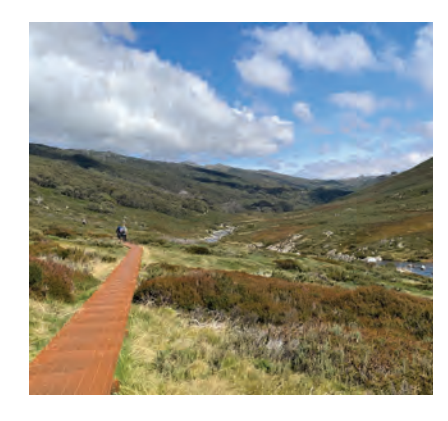
Along the Snowy