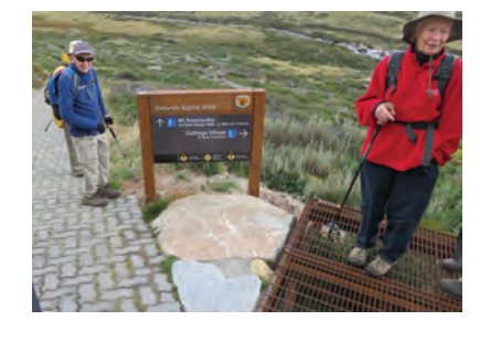
Snowies Alpine Walk Trackhead

The XC & BW page of the SASC website (https://www.sasc-aus.com/ cross-country-bush-walking-news) has details of past walks (description, pictures and maps) and a calendar of our upcoming walks.