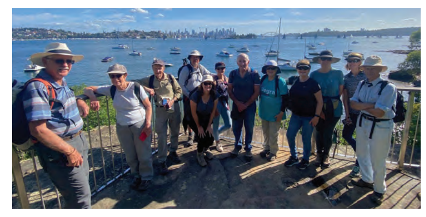
Dover Heights Walk

Our group has been spending Easter in the mountains since 2000. It has gradually become popular, but 2022 with Easter falling in the middle of the school holidays, it was the busiest we've ever seen.