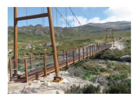
Spencers Creek Bridge