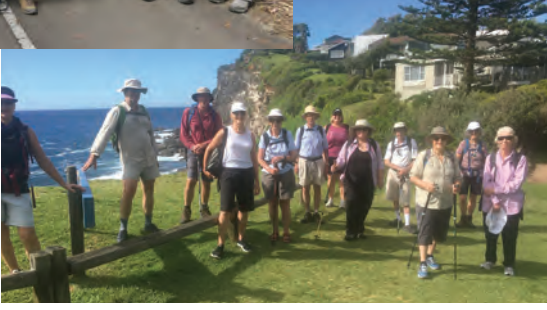
On Bangalley headland