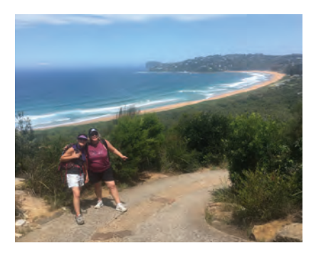
Palm Beach from the Lighthouse

The XC & BW section of the SASC website (https://www.sasc-aus.com/ cross-country-bush-walking-news) has details of past walks and a calendar of our upcoming walks.