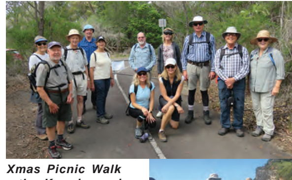
- the Kur-ring-gai Wildflower Gardens