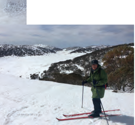
Above Wrights Creek