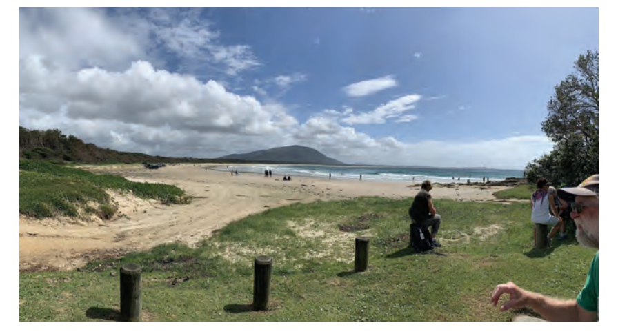
Diamond Head beach

We look forward to seeing you on one of our walks.