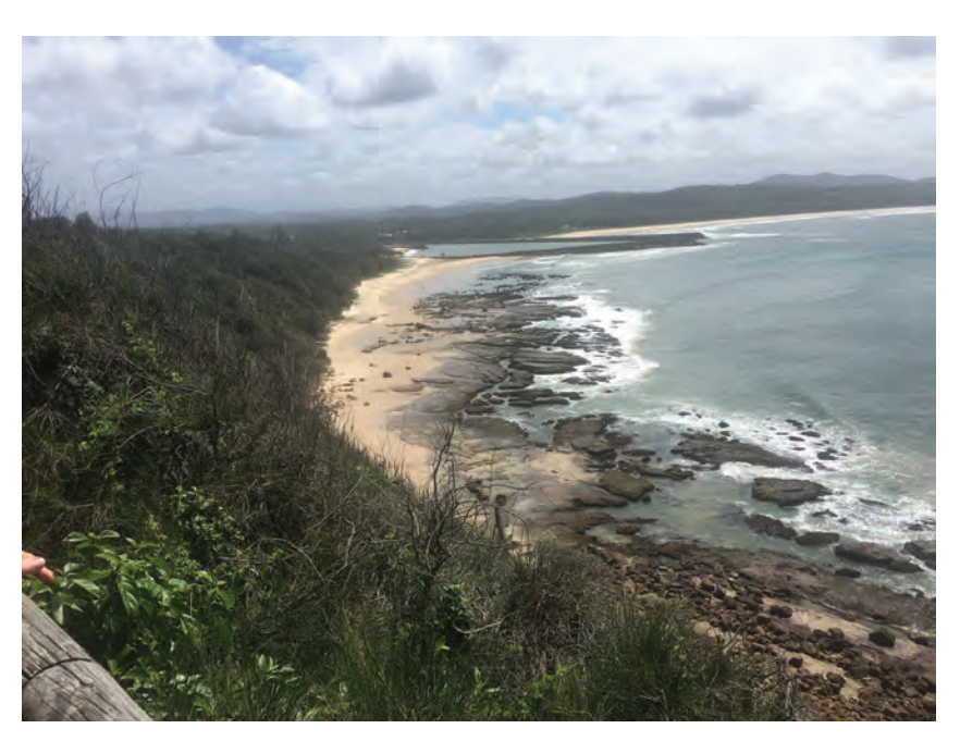
From Kattang Headland