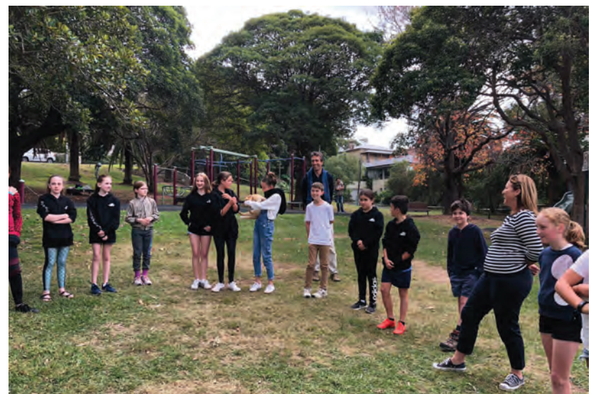
Warming up for bus trip at the BBQ