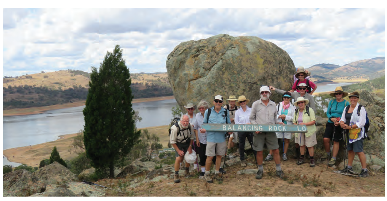
Balancing Rock Lookout at Wyangala