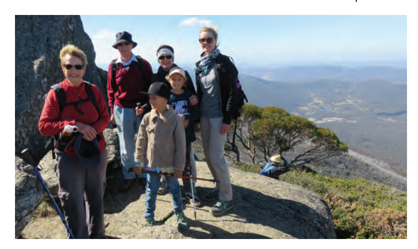
At the Porcupine Lookout

We look forward to seeing you on a walk soon. Please go to our SASC website for more walk photos.