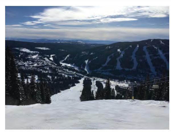
Looking down on Sun Peaks from Sunburst chairlift slope