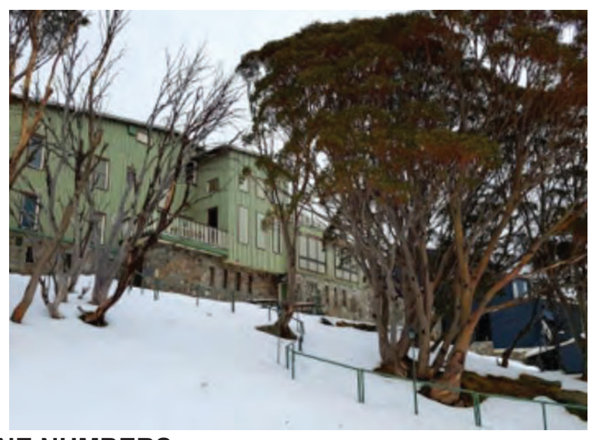
The Lodge at Charlotte Pass, ready for the season