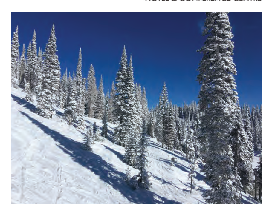
Slope beside SunBurst Chairlift, Sun Peaks Canada