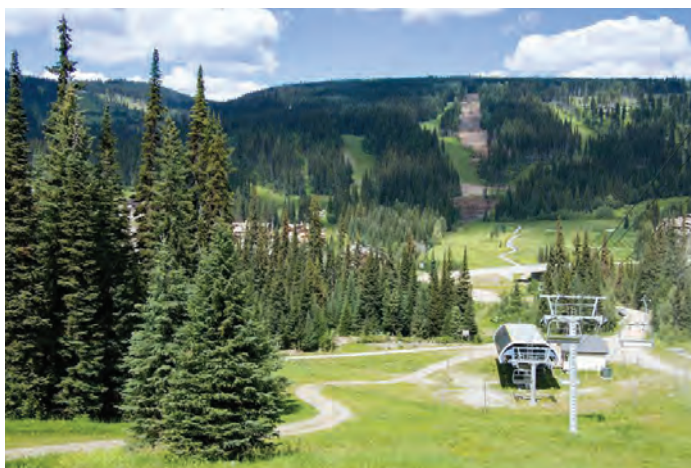
Construction of the new Orient quad chairlift at Sun Peaks

Nancy Greene's CAHILTY HOTEL & SUITES AT SUN PEAKS RESORT