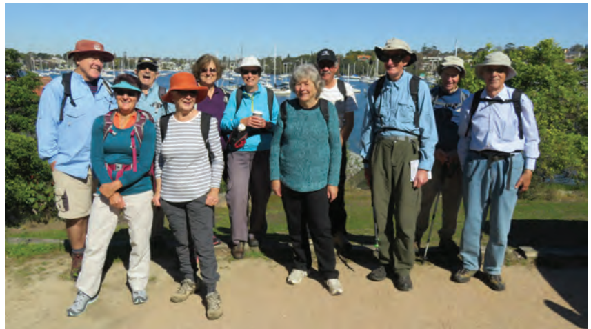
Lunch at Woodford Bay Reserve

After taking the ferry to Bundeena we walked to Jibbon Pt to view the rock art then south to Sandy Beach and up to the cliffs for great views up and down the coast. After lunch we completed the