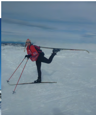
Enjoying the Main Range on the Summit Tour Bus Trip