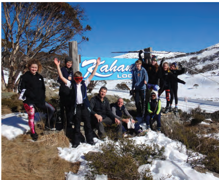
Junior Race Team