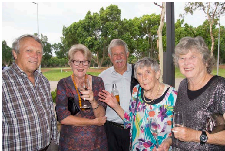
Pre-dinner drinks at the End of Season Party