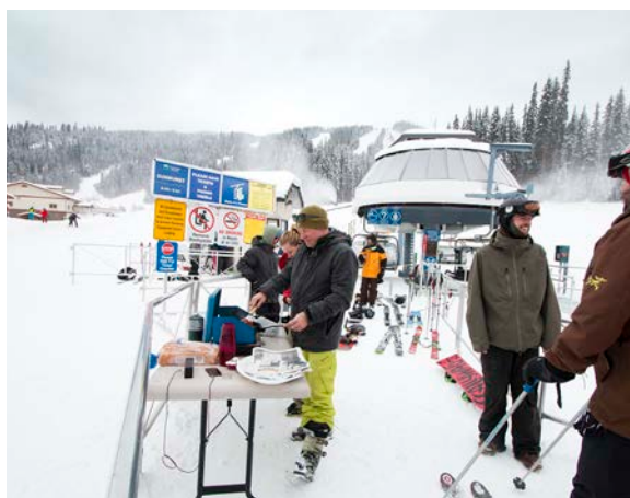
Breakfast at Sun Peaks – most important meal of the day

The excitement built. The clock ticked down. The ropes dropped. And so began the best opening day in the history of Sun Peaks Resort.