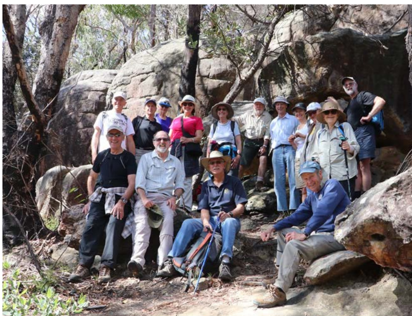
Thornleigh to Hornsby Walk