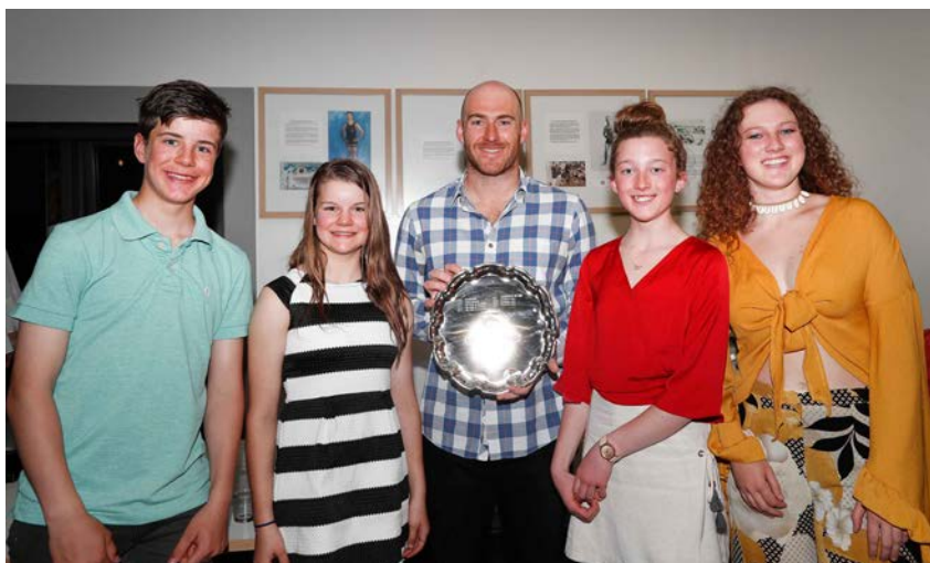
SASC winning team at presentation of NSW Alpine.