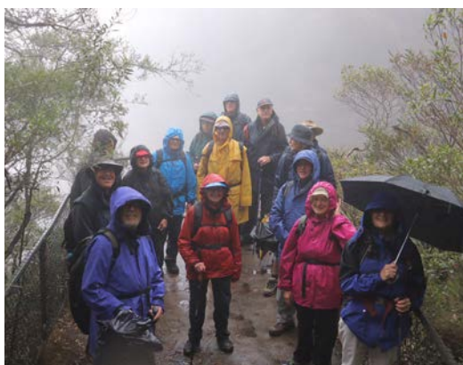
Bridal Veil Falls Lookout