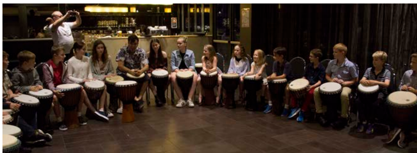
End of Season Party drummers