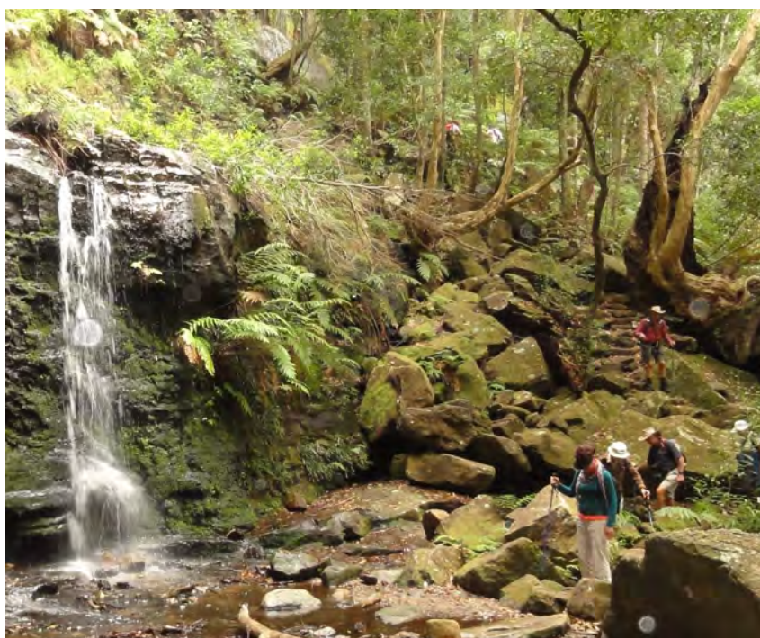
Fairy Bower Falls, Bundanoon - (report next newsletter)