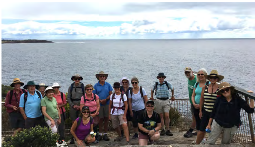
Dee Why Reserve