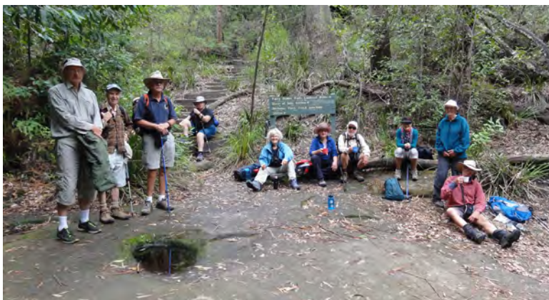
Fairy Bower Falls Walk, Bundanoon - (report next newsletter)