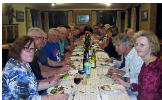
Kahane working bee dinner