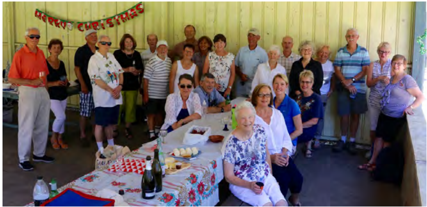
Christmas Picnic Walk

We look forward to seeing you on a walk soon.