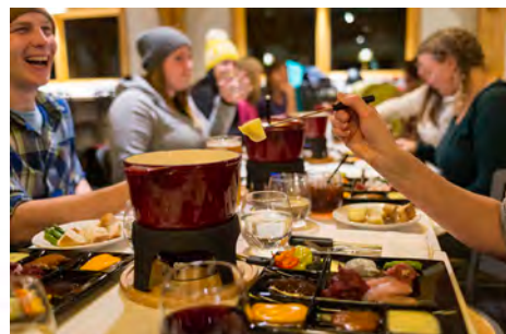
Sun Peaks - Alpine Fondue

Nancy Greene's CAHILTY HOTEL & SUITES AT SUN PEAKS RESORT