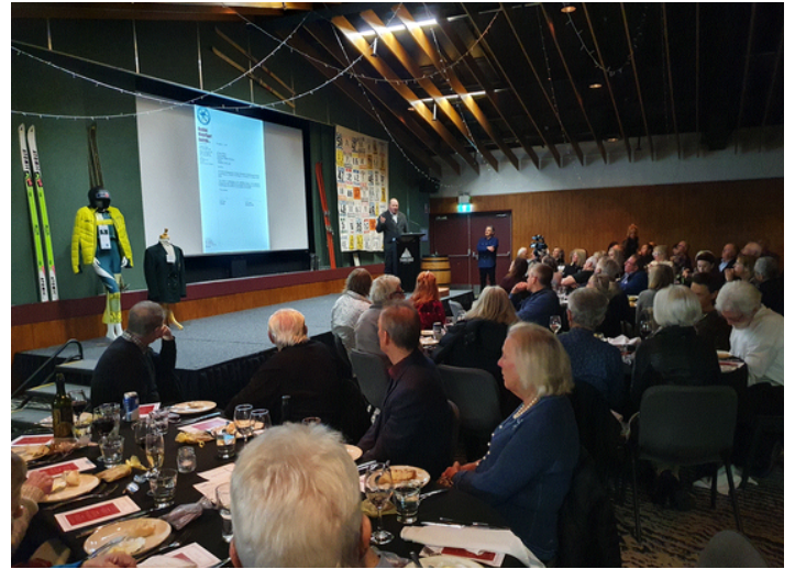
Guests at the 2022 Mid Winter Dinner