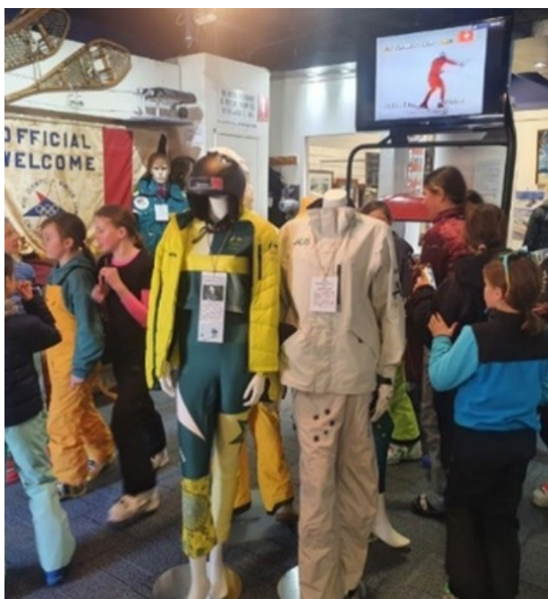
Thredbo Mountain Academy students enthusiastically explore the Museum.