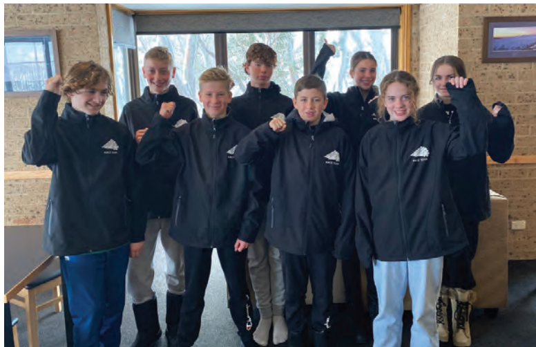
Junior Race Team