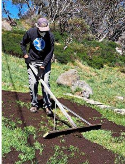
Kahane site revegetation