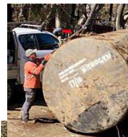
Removal of old fuel tanks at Charlotte Pass

This native insect is thought to have lived amongst eucalypt populations for a long time, playing a sustainable role within the ecosystem, however the mountain air has become warmer and drier, drawing more moisture out of the trees and creating ideal conditions for the longicorn beetle to thrive.