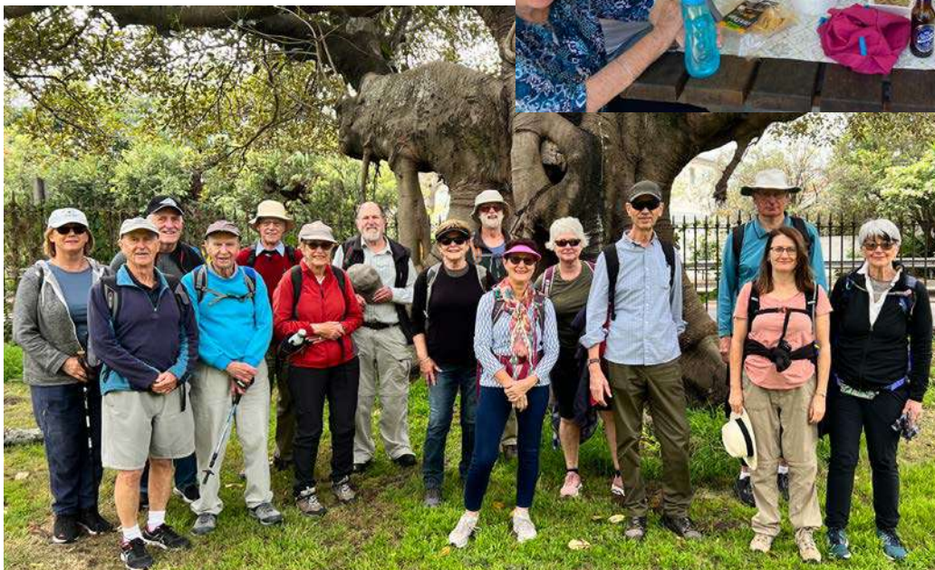
City Ramble - in Centennial Park