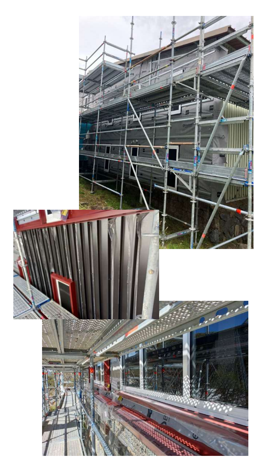
Southern Alps Lodge, Charlotte Pass – construction details