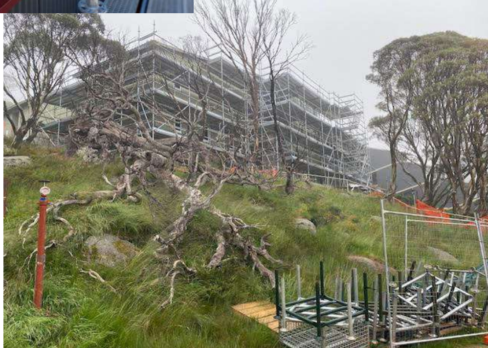
Southern Alps Lodge at Charlotte Pass, wrapped in scaffolding.