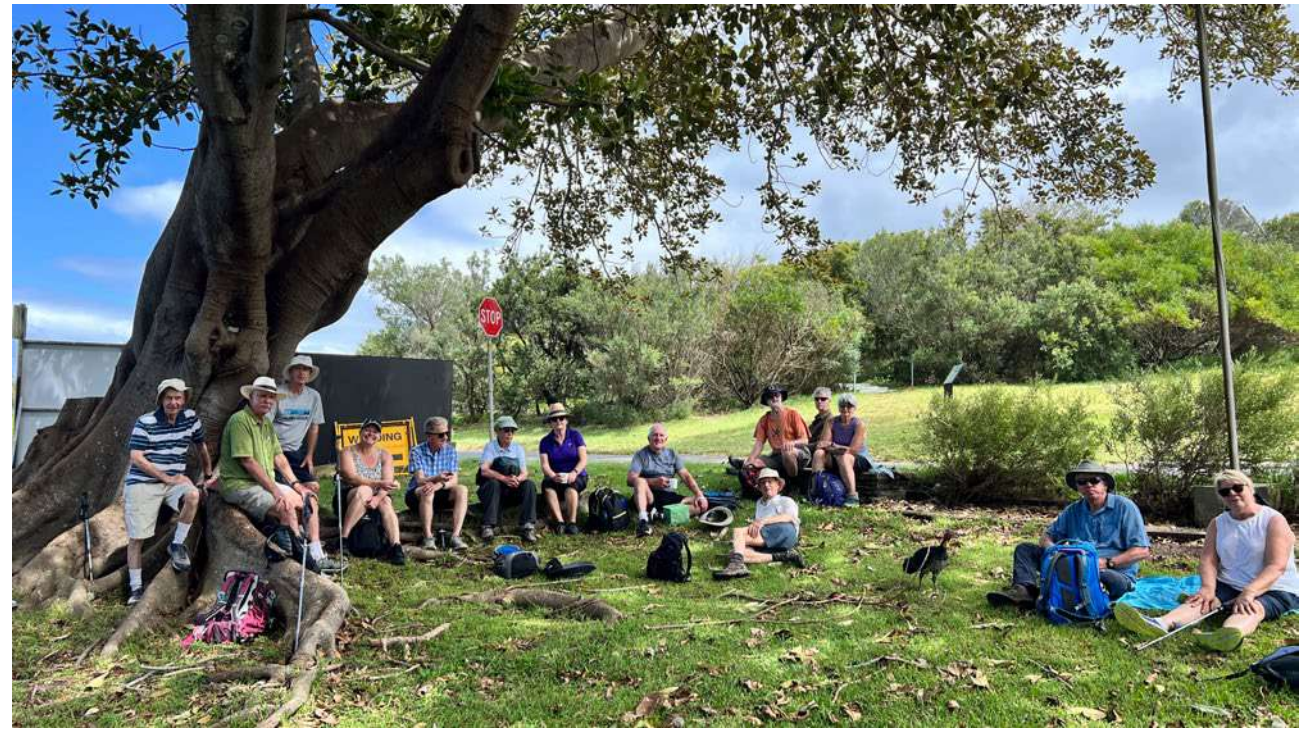
Morning Tea at North Fort