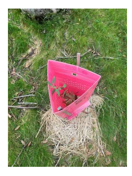
New Snow Gum at Kahane Lodge